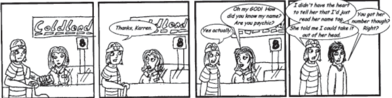
Read My Mind

from our members at DingBobik Comics < www.freewebs.com/dingbobikcomics >