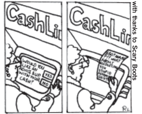
with thanks to Scary Boots

Concerned about the number of incidents where unarmed people have been shot, the Home Office announced today that it was taking steps to deal with such problems. Now, all criminals suspected of carrying a weapon will be handed a short questionnaire to fill in, aimed at removing all doubt and thus preventing future tragedies. A sample is reprinted here: